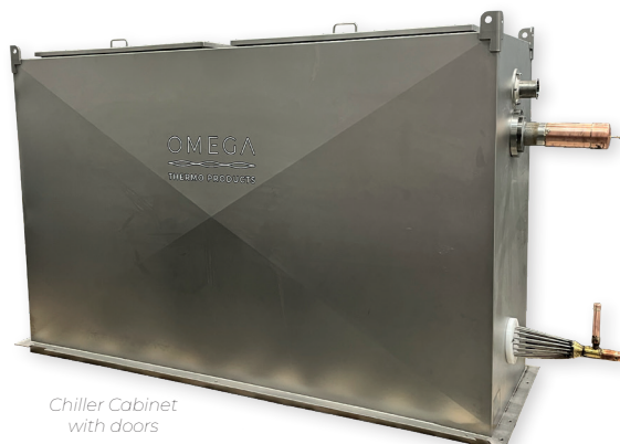
Chiller Cabinet with doors

Cooling Equipment and Kemper Refrigeration worked closely with the Omega engineering team and was able to meet all of the customer's requirements and provide them with a Falling Film Chiller to fit into their current wash system. The chiller consists of an eight (8) plate distribution pan for water distribution over the plates, eight (8) evaporator laser plates, a chiller cabinet with both top and end doors as well as an insulated collecting tank at the bottom that can hold up to 375 gallons of water.